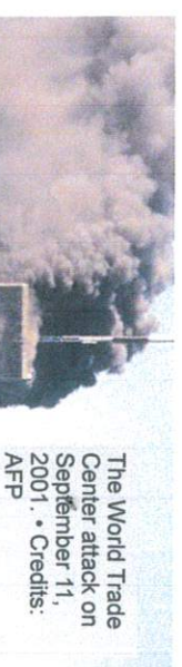
The World Trade Center attack on September 11, 2001.

At 8am the flight AA11 was hijacked, and at 8am46 the plane AA11 (to Los Angeles) crashed into the North Tower, and at 8am53 another plane (the flight UA175 which was also destined to Los Angeles) crashed into the South Tower.