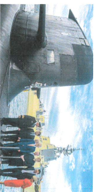
French President Emmanuel Macron and then Australian Prime Minister Malcolm Turnbull on the deck of an Australian submarine in Sydney, May 2, 2018

France was supposed to supply 12 conventionally powered submarines to Australia. This contract was called « the contract of the century » by France, a contract worth 56 billion euros.