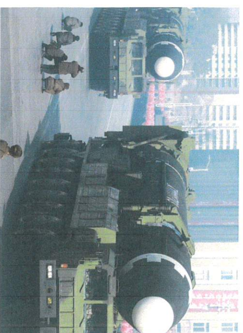
Hwasong-15 missiles during a parade on a Pyongyang avenue in February 2018.