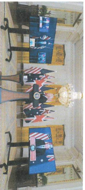
US President Joe Biden in a video conference with Australian Prime Ministers Scott Morrison and British Prime Ministers Boris Johnson at the White House on September 15, 2021.

DIPLOMATIC TENSION BETWEEN FRANCE AND THE USA. For the first time in history, France repatriates its American ambassadors.